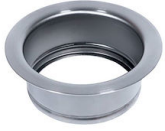
Waste disposer throat 8669 043