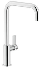
Faucet Sicilia 8485 005