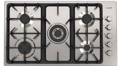
Professional series Cooktop 5 burners STD Edge 7055 962