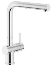
Faucet Ponza 8497 025